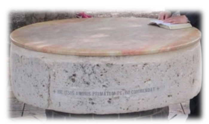
Hic Iesus Amoris Primatum Petro Commendat "Here, the Love of Jesus Commended the Primacy to Peter."

To unpack the meaning of this phrase let's start with what the Orthodox mean by "equal?" First, to who was Peter equal? That is simple the other Apostles